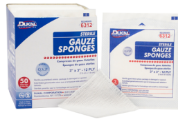
Bandages & Dressings