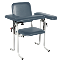
Blood Drawing Chairs

Find our full line of products at dukal.com